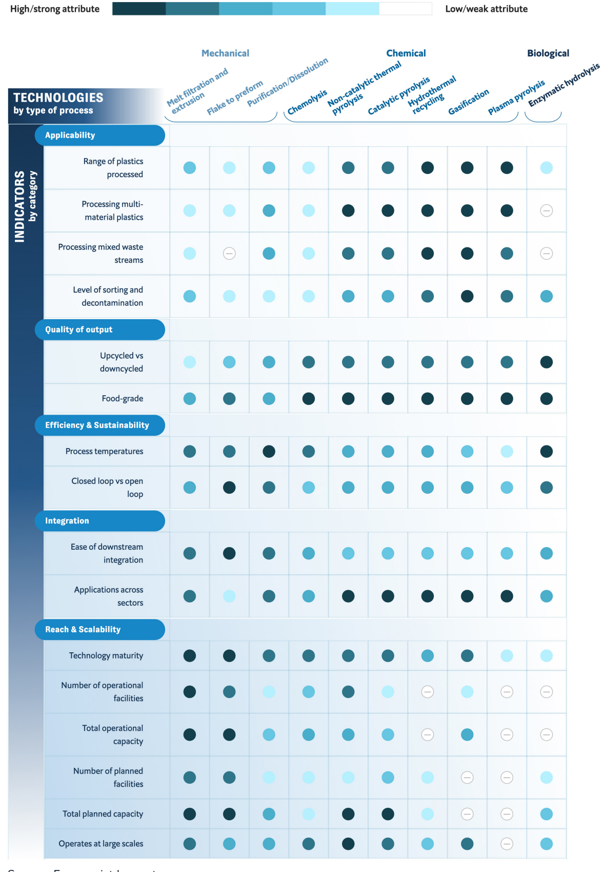
Figure 3: Plastic recycling technologies assessment